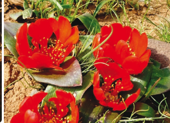
LEFT: Massonia depressa on the Rooihoogte Pass between Montagu and Touws River.