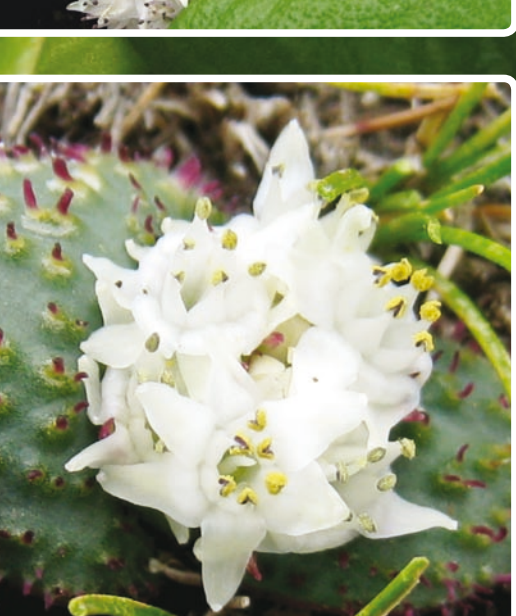
TOP RIGHT: The lowland form of Massonia jasminiflora found near King Williams Town in the Eastern Cape.